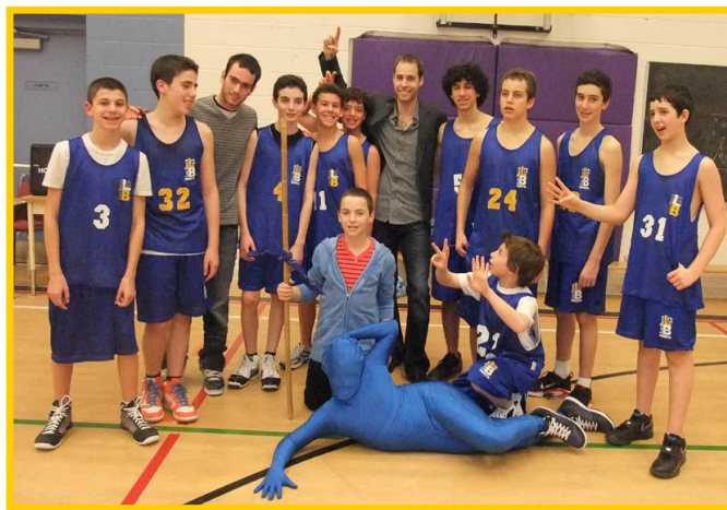
Our boys' basketball team season ended last week. They finished the season with 4 wins and 4 losses in the regular season. In the quarterfinals, they beat Netivot but unfortunately lost to Associated in the finals, finishing 4th overall in the standings. Way to go boys!