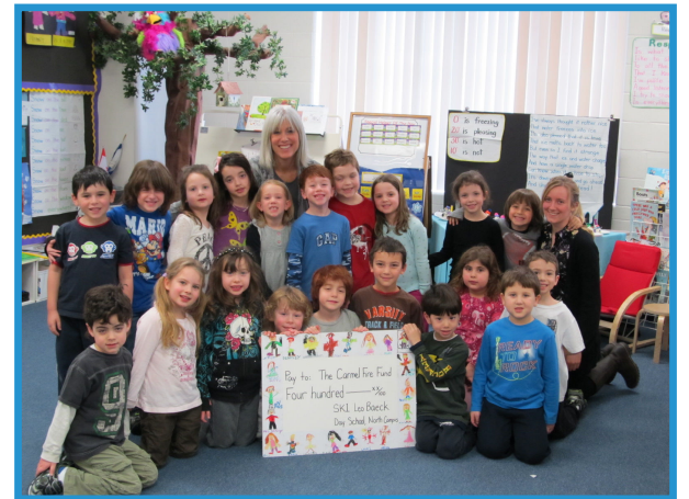
SK1 students at the North Campus raised $400 from their tzedakah funds from September to January to donate for the relief efforts in the Carmel.

Grade 5 took Tu B'shvat to a whole new level this year. As part of the discussion on fundraising, students were given the option to create fantasy trees as well as real trees that grow in Israel or here in Canada to symbolize the tree donated by them or their family and friends. The result was a mural appropriately named a Forest of Trees that is now displayed in our hallway for all to enjoy. A total of 41 trees were donated to the JNF Tree Fund. Congratulations to Grade 5 students and their families. Thanks to your generosity, $738.00 will be spent in Israel planting trees for the future. Kol Hakavod!